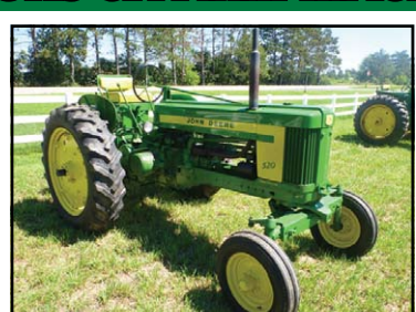
John Deere 520-WF, Dual Hydraulic, 3pt, PTO, gas, fenders, power steering, showing 4325 hours, s/n 5207487