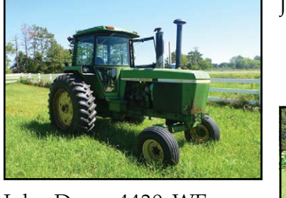
John Deere 4430-WF, Triple Hydraulic, 3pt, PTO, diesel, cab, showing 7738 hours, s/n 4430H048743R