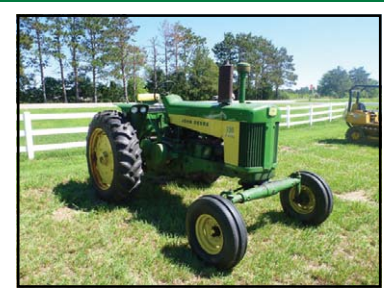
John Deere 730-WF, Dual Hydraulic, 3pt, PTO, diesel, power steering, fenders, showing 3370 hours, s/n 7311169 John Deere 3010-WF, Dual Hydraulic, 3pt, PTO, gas, fenders, showing 3703 hours, s/n 38741