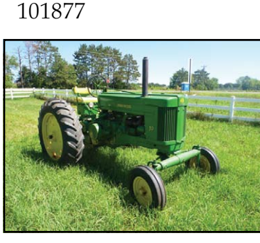
John Deere 70-WF, Dual Hydraulic, PTO, gas, s/n 7012446