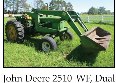
Hydraulic, 3pt, PTO, gas, with JD 58 hydraulic loader and 4' manure fork, fenders, showing 2772 hours, s/n 009636R

Loading will be available after the auction on Thursday, April 13; Friday, April 14: and Saturday, April 15. All items must be removed by April 15 unless other arrangements are made with owners of the property. Live online bidding provided by Proxibid on major items only. No Buyers Premium.