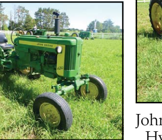
John Deere 420-WF, 3pt, PTO, gas, fenders, showing 1178 hours, s/n

John Deere B-NF, PTO, gas, s/n 111739 John Deere B-NF, PTO, gas, new tires, s/n 34623 John Deere B-NF, PTO,