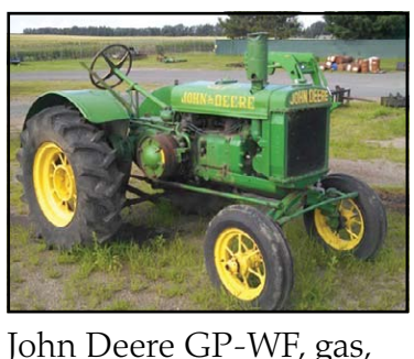
John Deere GP-WF, gas, fenders, s/n 222811 John Deere MT-WF, PTO, gas, fenders, s/n 25425 John Deere B-NF, Dual Hydraulic, PTO, gas, s/n 262626