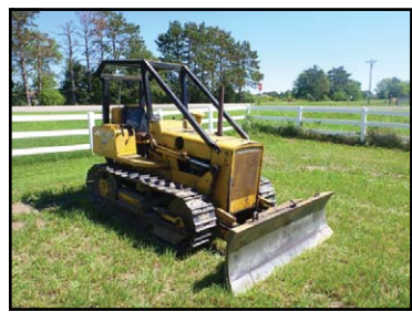
International 500 Series C Crawler Dozer- OROPS, 6 way blade 7', 14" tracks, s/n 4070016C002915