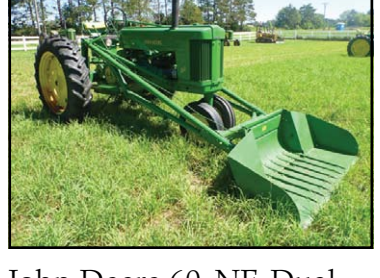
John Deere 60-NF, Dual Hydraulic, PTO, gas, with loader, s/n 6020547