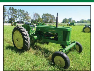
John Deere 50-WF, Dual Hydraulic, PTO, gas, fenders, s/n 5032807